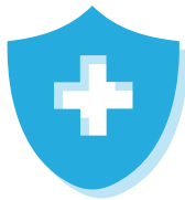
Medical, dental and pharmacy expenses

Each state has a Victims' Compensation program to assist victims and their families with financial costs associated with a crime. Child Advocacy Centers and other victim-serving agencies are a useful resource to assist families in applying for Victims' Compensation. In some states, the application may be available online. Although it varies by state, some of the expenses that qualify for compensation may include: