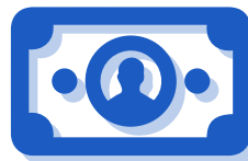
Lost wages or lost support

Family members may be eligible to apply for compensation depending on state regulations and the nature of the crime. Please contact your local Child Advocacy Center for information on your state's specific Victims' Compensation eligibility standards. More information is available at www.ovc.gov .