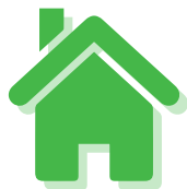
Loss of essential personal property